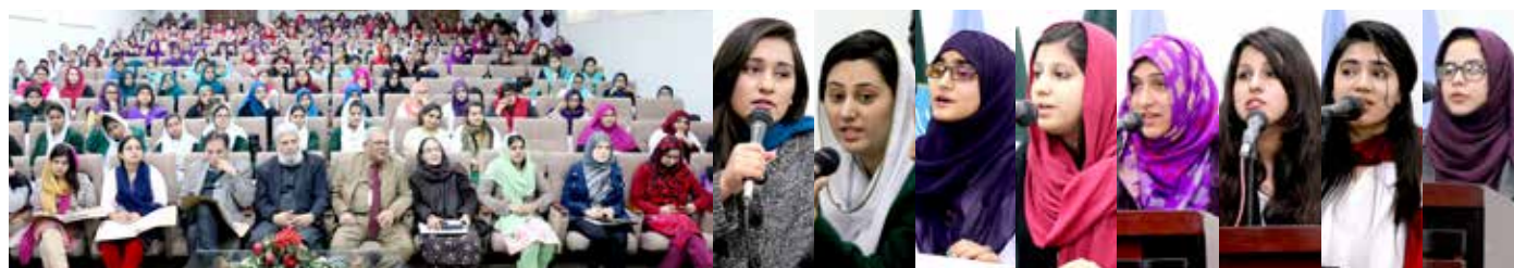
Students participating in Poetry and Baet Bazi Competition