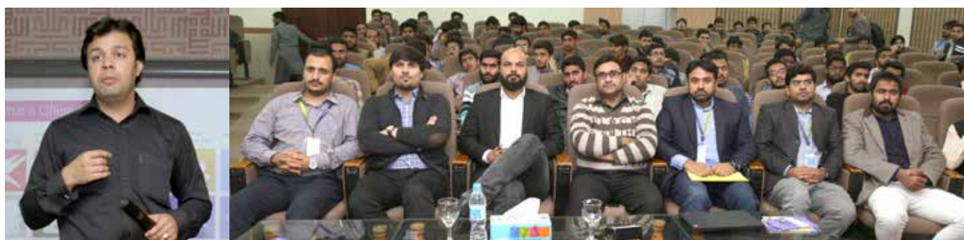
Introductory lecture about Microsoft Imagine Cup

competition to Pakistan. This will be a good opening for the youth of Pakistan to take part and make use of their potential by bringing their inventiveness and their devotion towards creating technological solutions. They will be able to bring their final year projects and contend to win $100,000. This competition will help students take their project to the next level.