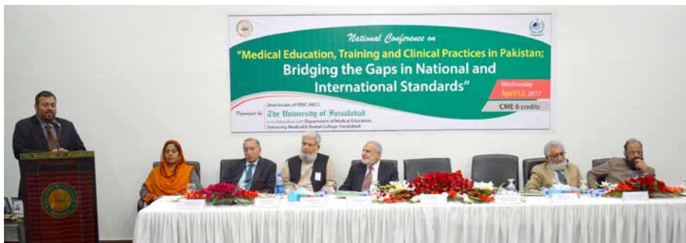
Prof Dr Junaid Sarfraz Khan, VC, UHS expressing his views

The aim of the conference was to provide a forum of discussion on the present state of affairs in medical education, training and clinical practice. It provided an opportunity for development of strategies to upgrade our present system of medical education and clinical practices with the objective of bringing it at par with developed countries of the world.