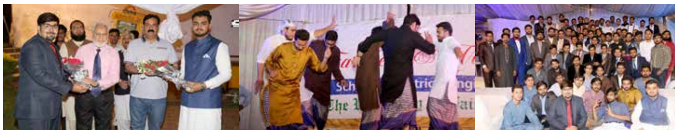
Glimpses of Farewell and Welcome Ceremony