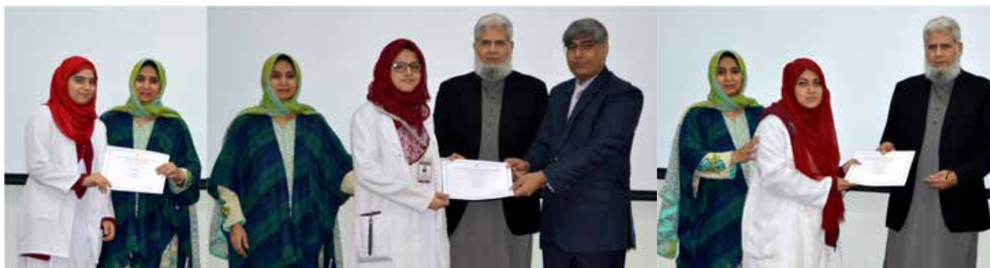
Promising students being awarded certificates