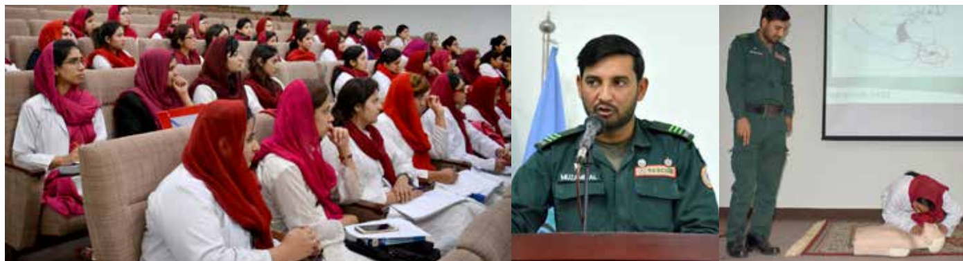
Training sessions by 1122 team

were also performed for Cardiopulmonary resuscitation, danger, Fire Extinguisher, choking, abdominal thrust in adults and children. The students appreciated the efforts of University management for arranging these useful training sessions.