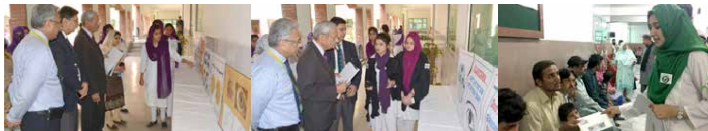
Visitors see posters displayed by students of OD. Awareness flyers are being distributed in MTH