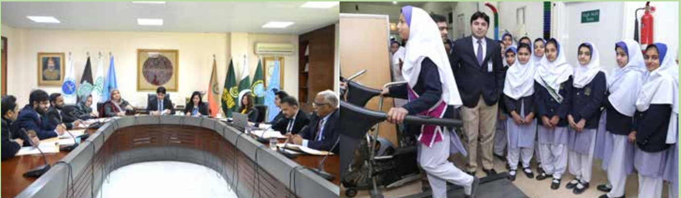
Meeting Board of Studies of School of Rehabilitation Sciences