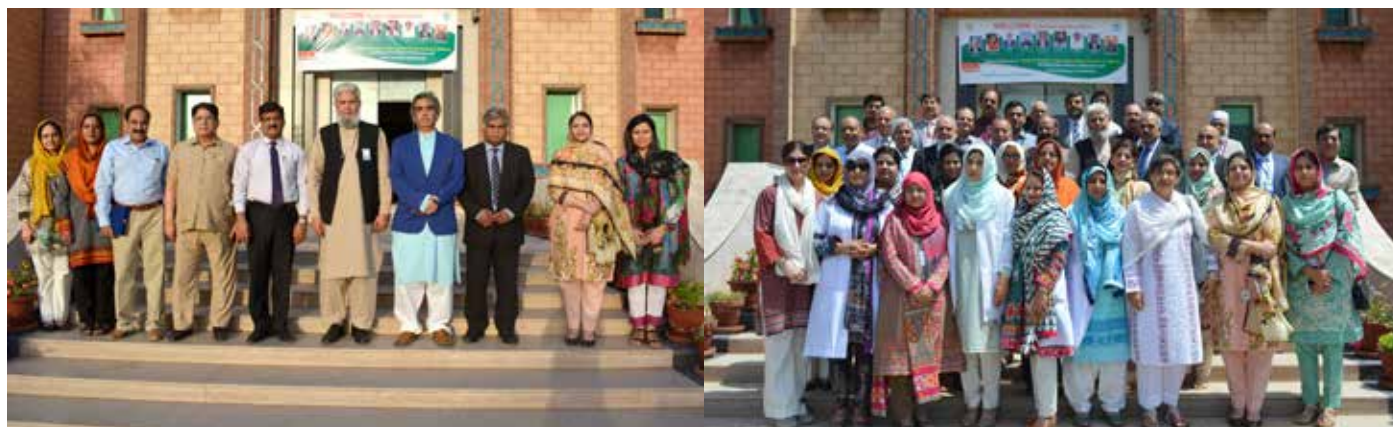
Group photos of the participants