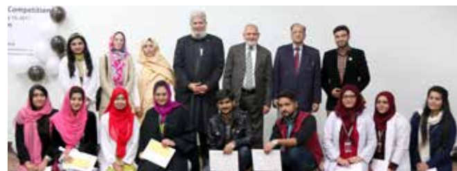
Winners with chief guest and judges

The position holders were awarded certificates and prizes.