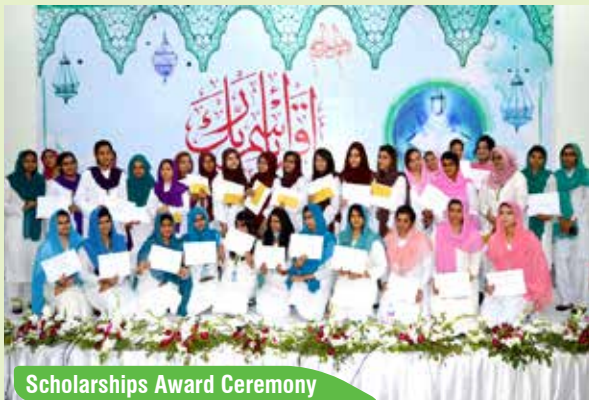
Scholarships Award Ceremony