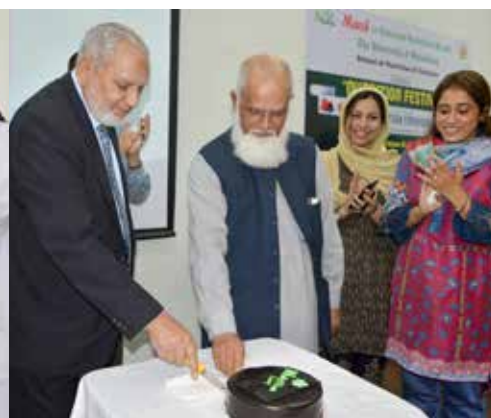
Cake cutting ceremony