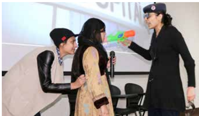
Students perform in a skit