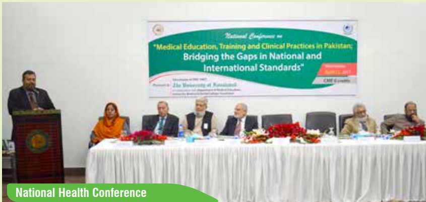
National Health Conference

Volume : 13 Issue: 1 January - April 2017 Rabi ul Sani - Shaaban 1438