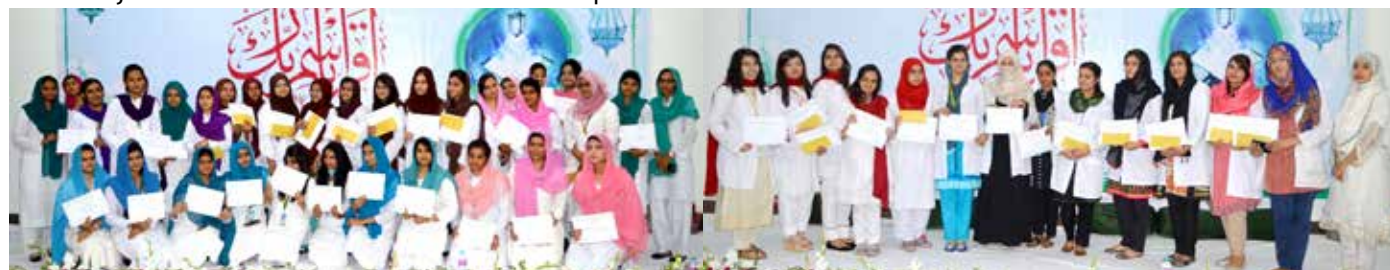
Meritorious Scholarship holders of TUF and UMDC

distinction certificates to promising students in a graceful ceremony held in Saleem Auditorium. In Engineering Campus, nine students of complimentary program for BSCS Fall-16 were awarded merit scholarship where as fourteen students of Fall-16 from BEE, BET, DPT and BSCS-FA-13 were awarded cash prizes and certificates.