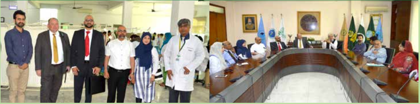
Members of a renowned Software Development Company from USA during the visit of Dental Section, Madinah Teaching Hospital and meeting with senior faculty members of TUF