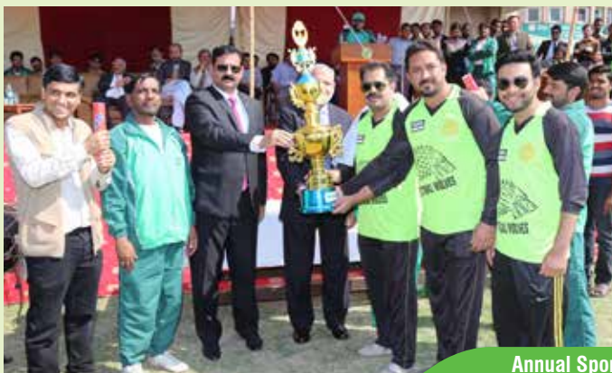
Annual Sports Gala -2017