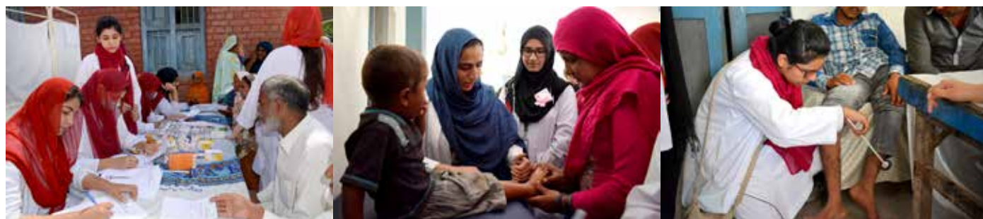
Free Health camp by School of Rehabilitation Sciences in Samana Village

Government dispensary in Samana inaugurated the camp activities. Teams of expert Physical Therapists, Dietitians, Pharmacists and students from TUF and Nursing & Paramedical staff from Madinah Teaching Hospital provided free facilities of medical checkup and diagnosis to the hundreds of patients daily with the help of latest machines and equipment. Free medicines were also distributed at the camp, and some patients were referred to Madinah Teaching Hospital for further care.