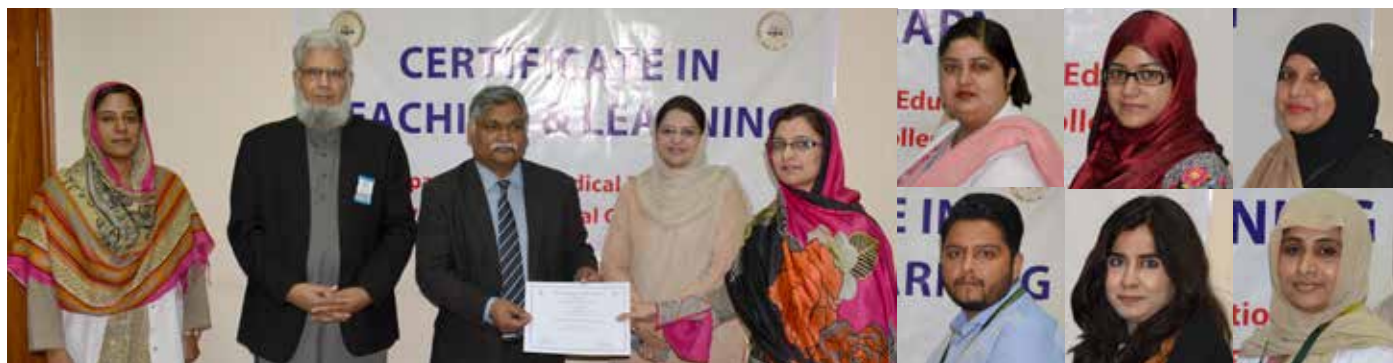
Participants of CTL receive certificates