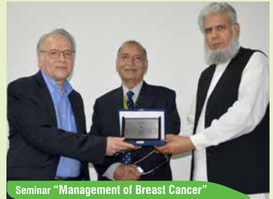
Seminar "Management of Breast Cancer"