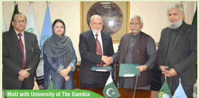
MoU with University of The Gambia