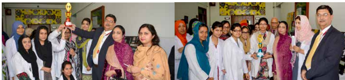
Winners of poster and model competitions