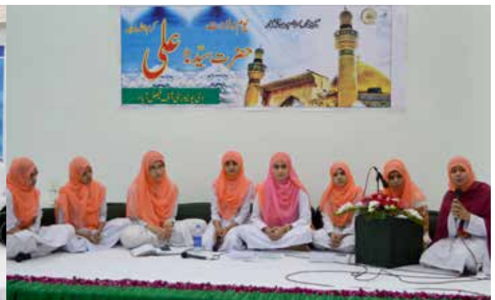
Poets paying tribute to Hazrat Ali karram Allah Wajhahu. Students offering Manaqib