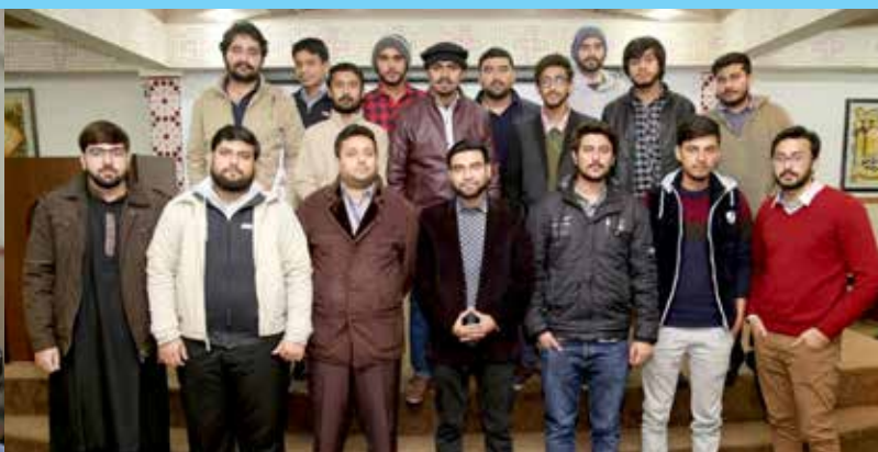
Singing Club Inauguration Ceremony in Engineering Campus, TUF on January 25, 2017