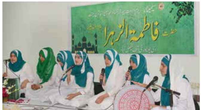
Students offering Manqabat

Expressing their views, students threw light on the Holy life of Syeda Fatima (Salam-Ullah-Alaiha) as a great religious personality in the history of Islam. They emphasized that the Muslim women must follow the footsteps of Syeda Fatima (Salam-Ullah-Alaiha) so that they may succeed in this world and hereafter.