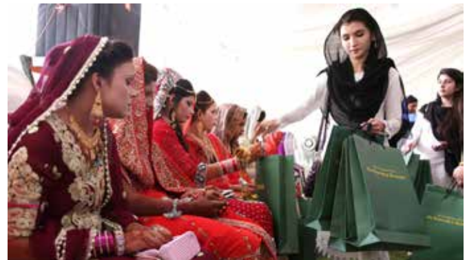
Students presenting gifts to the brides from Women Foundation

The guests appreciated the services of Madinah Foundation and The University of Faisalabad for this noble cause.