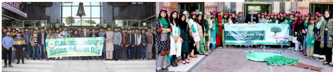
Senior faculty members and students participate in awareness walk and plant sapling to mark National Green Day