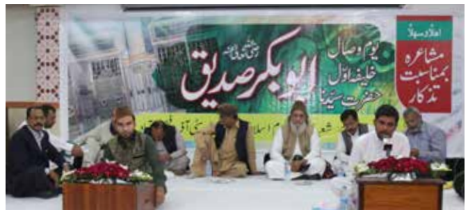
Poets offer Kalam, paying tribute to Hazrat Abu Bakar Siddique (Razi Allah Ta'ala Anho)