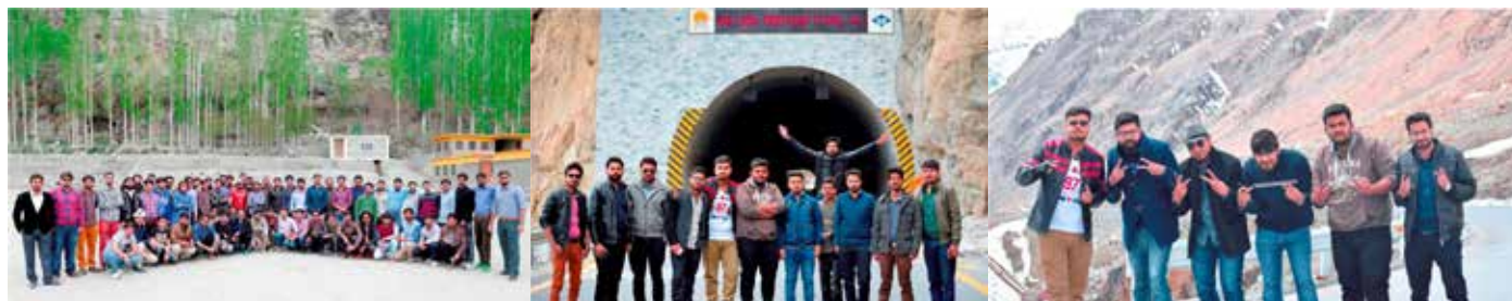
TUFIANS on recreational tour

and useful visit for young engineers. Later, students also enjoyed recreational tour of Hunza Valley, Khunjrab Pass, Altit and Baltit fort.