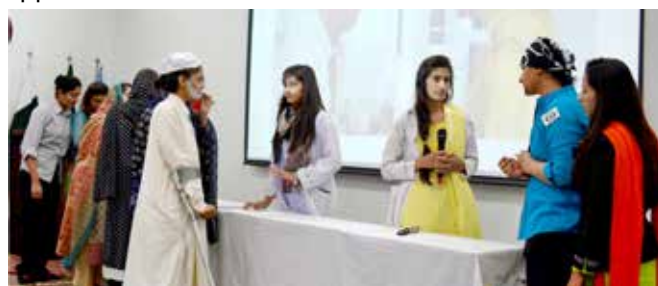
Students perform in a skit