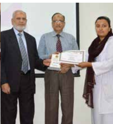
Winner receives prize and certificate