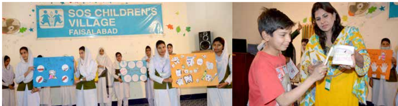
Children of SOS Village are being taught how to brush their teeth

objective of this visit was to identify the working of different NGOs and welfare organizations working for humanity and community development. Students attended interactive teaching learning sessions on personal hygiene.